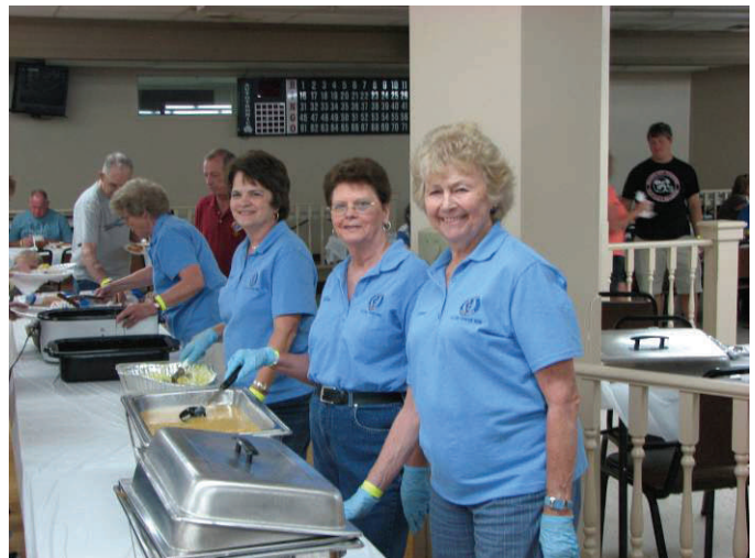
Ladies Auxiliary Family Picnic Food Servers